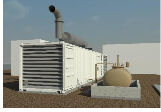
3D view of one of the two generating sets installed on site

The success of the project was also supported by the professionalism of KOHLER-SDMO, which was able to effectively involve SENER from design right up to commissioning. From electrical diagrams to calculation notes, factory acceptance testing and the issue of equipment calibration certificates, our personnel were able to provide transparent, precise and methodical information to SENER's engineering teams.